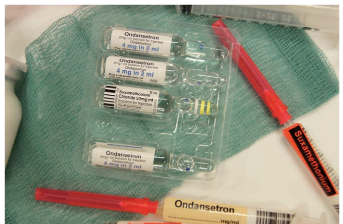
An example of a single loose ampoule of suxamethonium and how easily it might be drawn instead of (in this example) ondansetron

13.28 Preparation error accounted for a minority of the drug error cases reported to NAP5. A common thread between them was pre-existing organisational elements that were likely to have increased the chance for error to be introduced (i.e. latent errors).