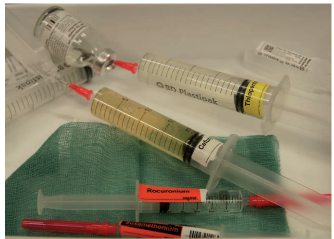
The similarity of appearance of thiopental and cefuroxime in close proximity

13.26 Seven drug preparation errors were reported (six of labelling error and one drug omission): and all led to awake paralysis and severe psychological sequelae. (Table 13.4).